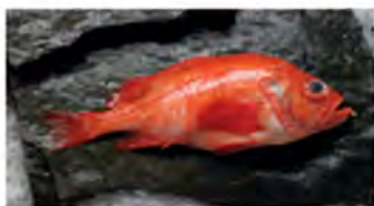
Clearwater a loser in Canada's redfish quota distribution

"So, we're continuing to work with the industry. We're continuing to work on economic diversification. We're continuing to work with other countries to add value to our products."