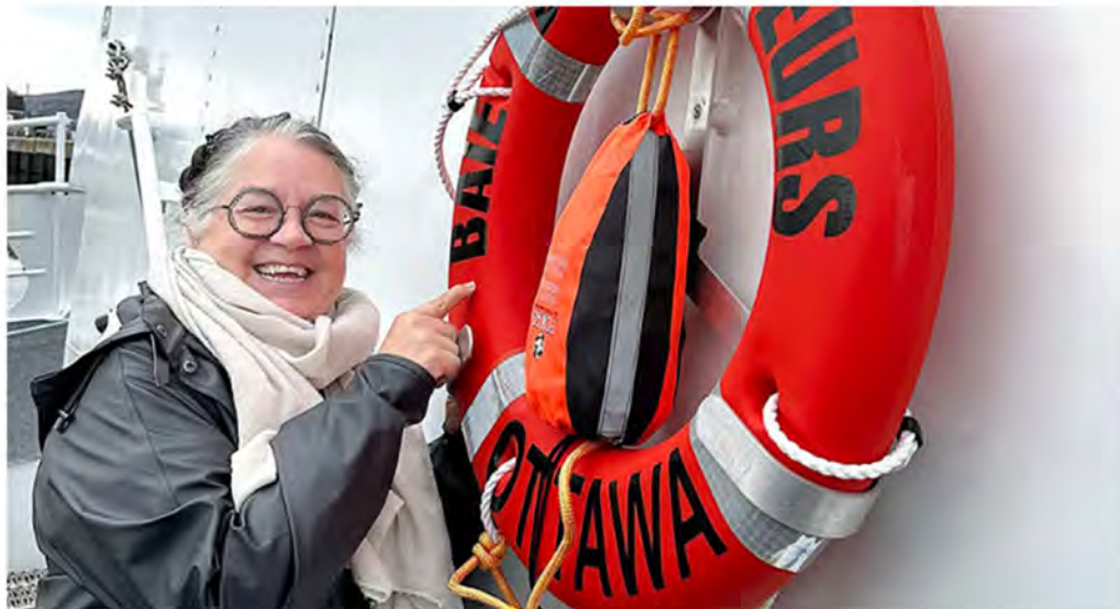
📷 Diane Lebouthillier, Canada's fisheries minister.

At that time the federal government offered a licence buyback program for cod harvesters and programs to retrain fishery workers who lost jobs on boats and in processing plants. The programs cost Ottawa more than CAD 3 billion ($2.2bn) as reported in 2022, on the 30th anniversary of the cod shutdown, by Saltwire Networks .